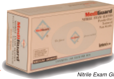
Nitrile Exam Gloves