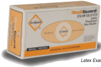
Latex Exam Gloves